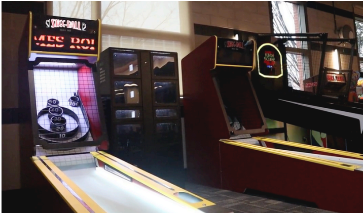
Shafer Court Dining @ VCU

This year was packed with RecRe installations across res life, campus rec, multiple student centers, and even a few in auxiliary services.