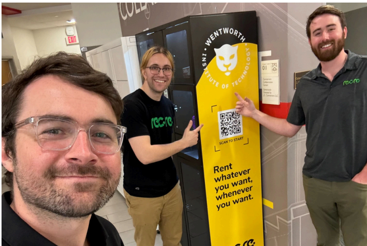
Beatty Hall @ WIT