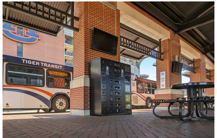
Campus Green @ Auburn University